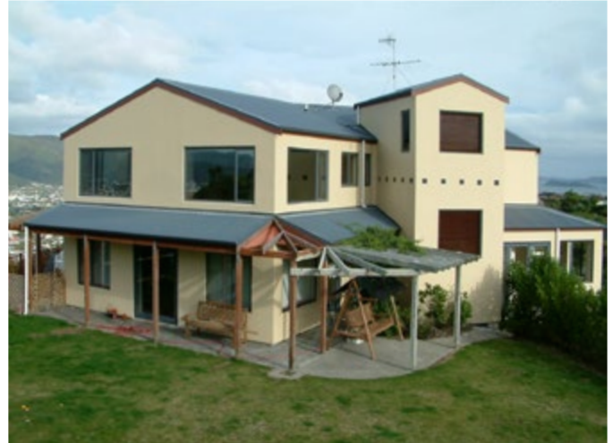
StoArmat Render System on Fibre Cement Sheet

Authorized distributor Ph. +61 8 9354 8871 Email. sales@stoanzwa.com.au